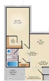
OPT DEN WITH OPT MORNING ROOM ON FIRST FLOOR