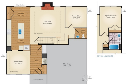
OPT IN-LAW SUITE