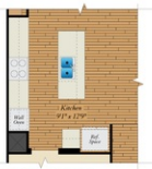
OPT GOURMET KITCHEN