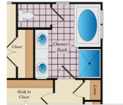
OPT SUPER BATH