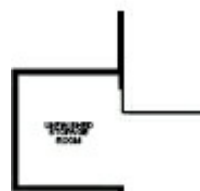
W/ OPT. CONSERVATORY