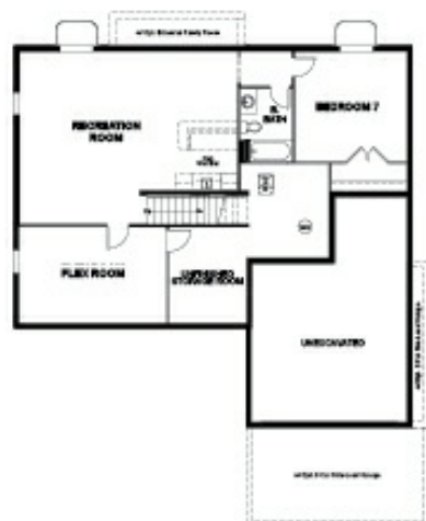
OPT. FINISHED BASEMENT