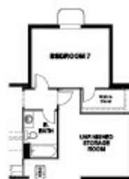
W/ OPT. SUNROOM 2