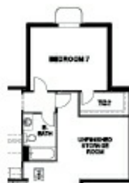
W/ OPT. SUNROOM