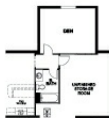
OPT. BASEMENT DEN W/ SUNROOM