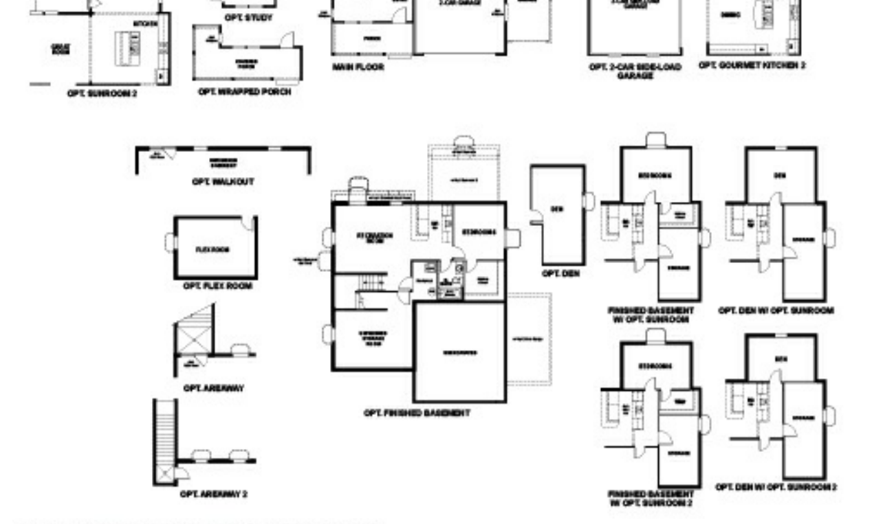
© 2018 Richmond American Homes. All rights reserved.