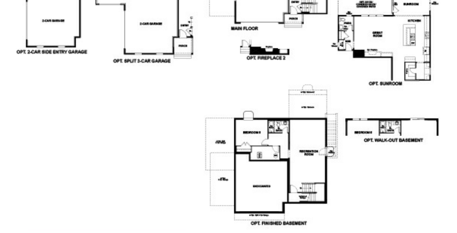
© 2018 Richmond American Homes. All rights reserved.