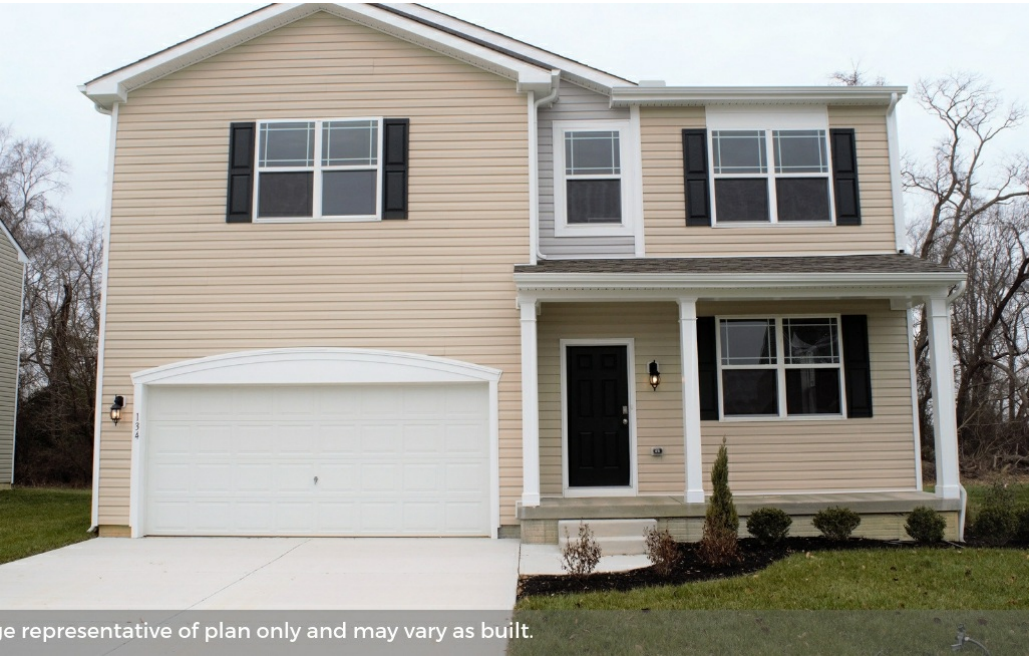
Representative of plan only and may vary as built.