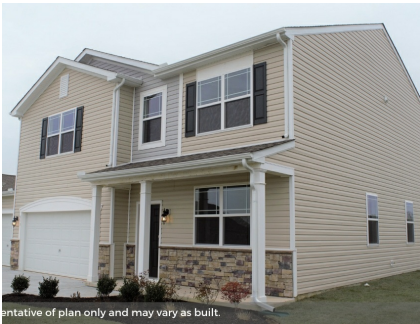
Representative of plan only and may vary as built.