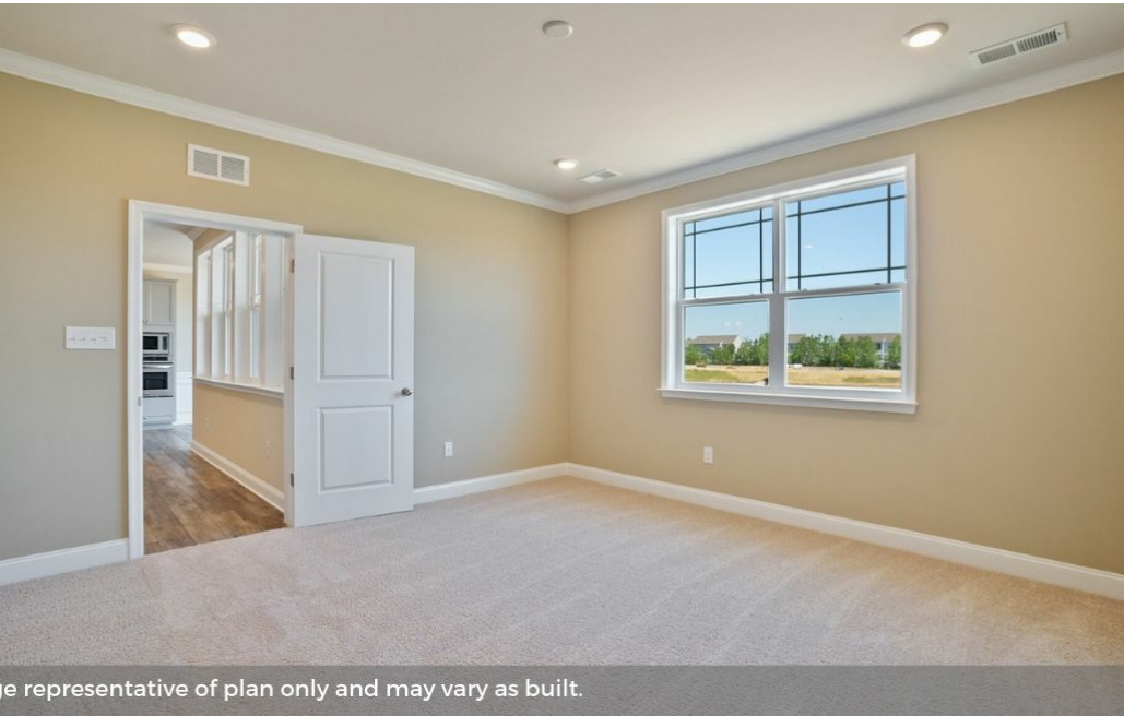
Representative of plan only and may vary as built.