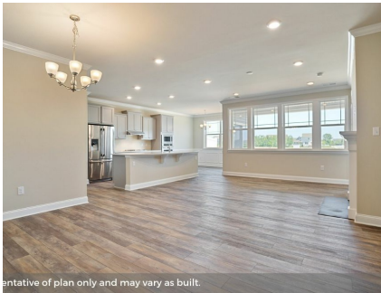
Representative of plan only and may vary as built.