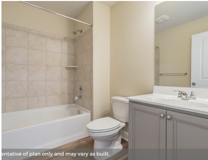
Representative of plan only and may vary as built.