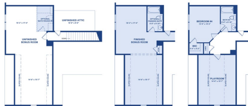
Standard Unfinished Second Floor Plan

(Optional Bath Rough-In only includes water supply and drain pipes)