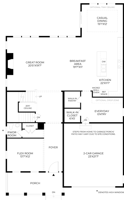
10' CEILING HEIGHT