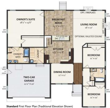
Standard First Floor Plan (Traditional Elevation Shown)