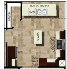
Optional Gourmet Kitchen

The Standard kitchen in the Whatley floor plan is isolated with impressive features, such as a full Energy Star® appliance package including a side-by-side refrigerator with ice and water in the door, a range/oven, microwave with integrated vent hood, dishwasher and disposal.