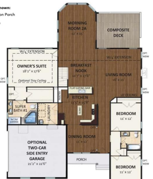
First Floor Plan With Popular Options (Hampton Elevation Shown)