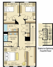
Stairs to Optional Fourth Floor