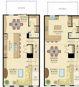
Optional Rear Kitchen