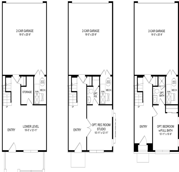
LOWER LEVEL PLAN