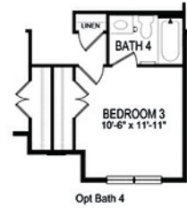
Opt Bath 4