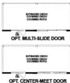
OPT. CENTER-MEET DOOR